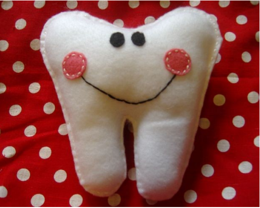
Jill Tacy - 2008 Pattern for personal use only.